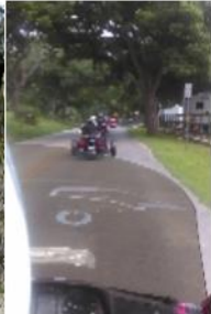
Wingin' in Texas Country