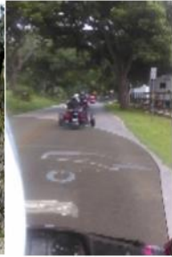
Wingin' in Texas Country